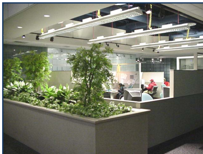
CIL Open Lab, Building 14

To be proactive simply means to predict possible problems and try to head them off. To be reactive means to wait and see what happens and then react. Many jobs have predictable “stress periods” — certain times of the day, week or year when extra strains are put on the office. By preparing for those periods in a proactive way the student employee can greatly reduce mistakes and stress.