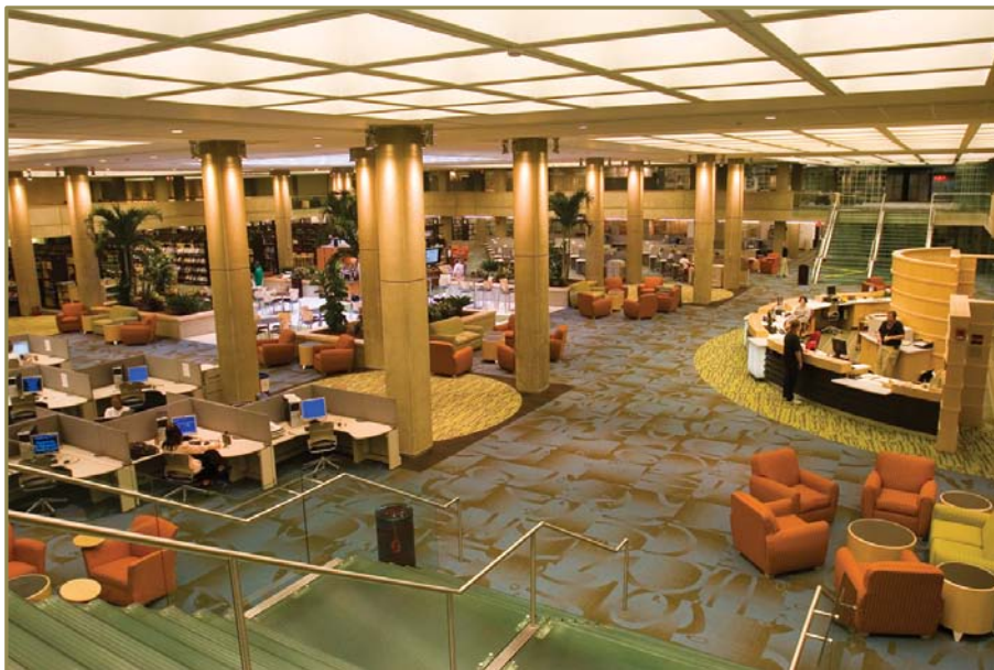
Library, Lower Level of Building 7