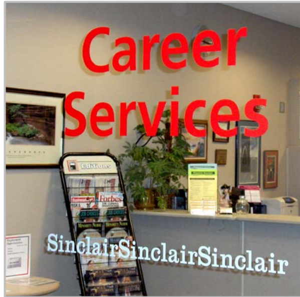
Career Services Office, Room 10-312