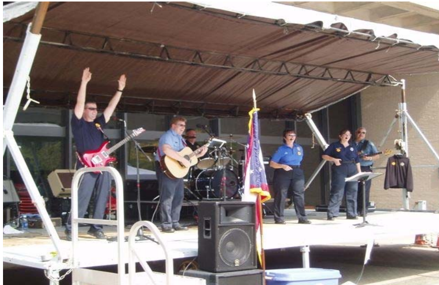
Knight Blaze, a local band comprising of police officers and fire fighters, perform each year during the annual Sinclair Safety Awareness Expo held during Fall Quarter.

The Sinclair Police will provide timely warning notices to the campus community whenever an incident is considered by the college to represent a threat to the campus community. Notices may be made via flyers on bulletins and distributed to offices, e-mail and/or fax notices to offices and on the department's web site at http://police.sinclair.edu . For additional information, please see page 4.